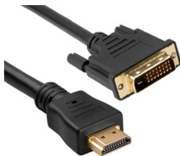
HDMI to DVI lead