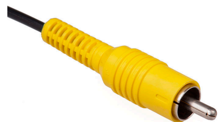
RCA composite video connector